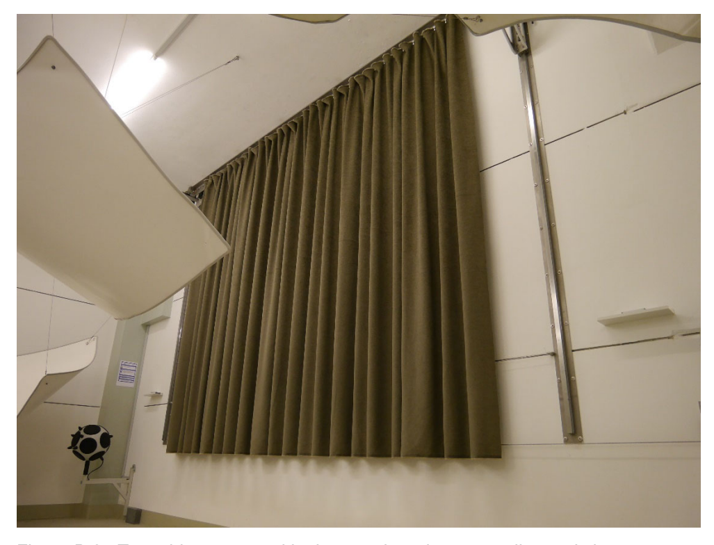
Figure B.2. Test object mounted in the reverberation room, diagonal view.